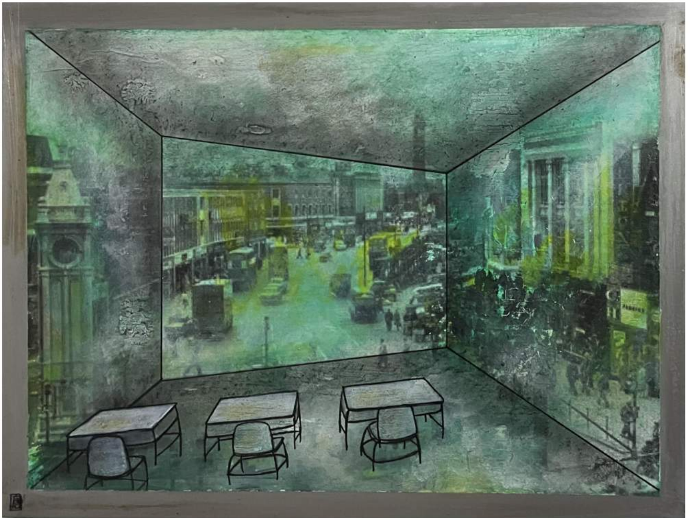
Lewisham High Street looking towards Lewisham Road (1960s)