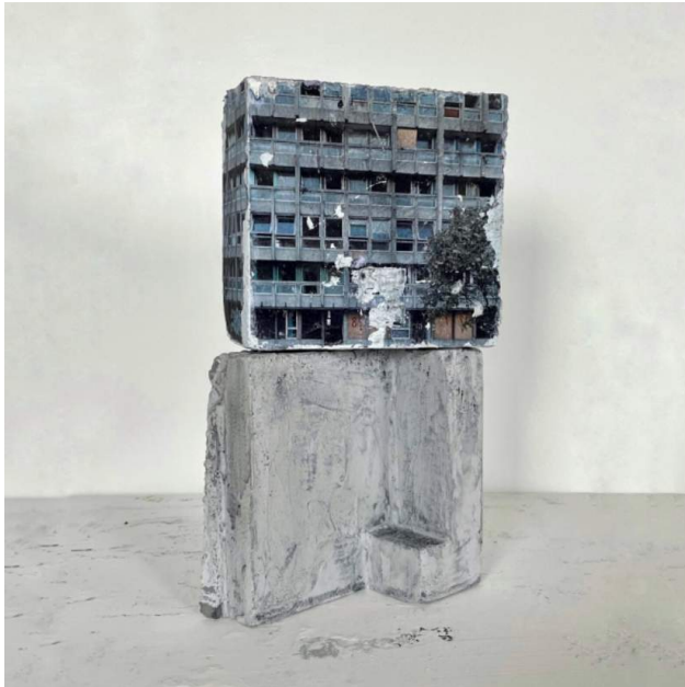
STRUCTURAL INTEGRITY W18 x H30 x D18 cm, 2021 £500