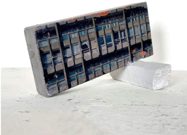
SIMPLY SUPPORTED W23 x H15 x D15 cm, 2021 (not for sale)

Sculpture medium: Acrylic, charcoal, and transfer on concrete grout over found polystyrene. The image transfer is of the Robin Hood Gardens estate in East London.